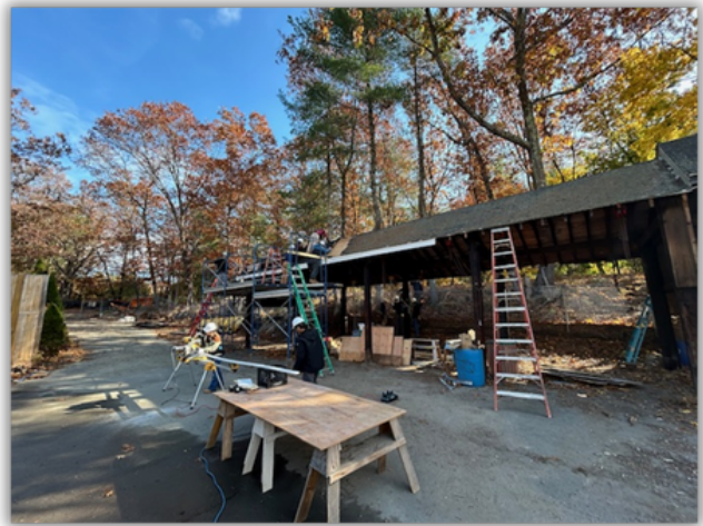
Cold Storage Facility