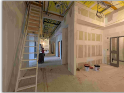
Second Floor Corridor