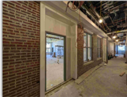
Second Floor Connector