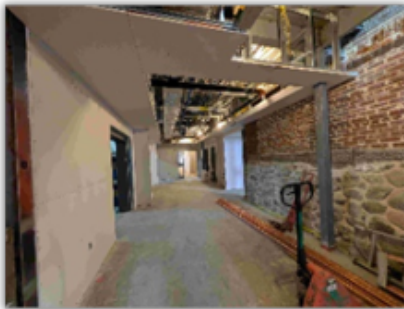
First Floor Corridor

On the outside, we're gearing up for the next steps: grading, retaining walls, fencing, curbing, and paving. As we track toward substantial completion by late January, the countdown to turn over the building to the Town (and begin the move-in process) has officially begun! By late February, final touches will wrap up, and the vision will be fully realized. Stay tuned as we bring this project to life!