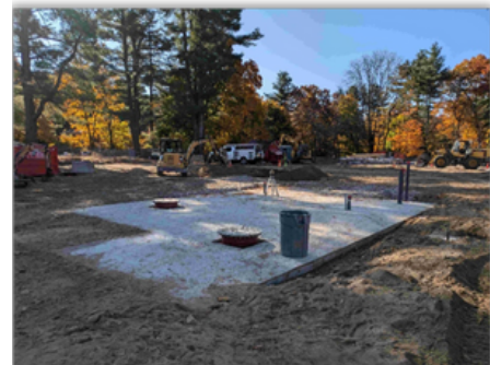
Underground Storage Tanks